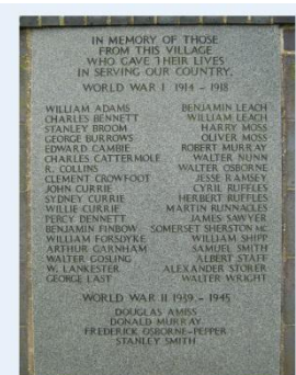
Families of those men from WW1 named on the Otley village war memorial

This booklet gives background information on the families of over 30 men from Otley who died during the First World War. If you have information about Otley men who served and survived, the Group would love to hear from you.